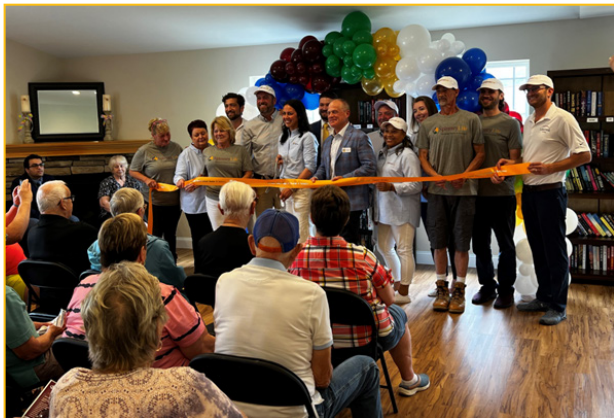
LiveWell Group, One Juniper Drive in Delmar VISIT livewellgroup.com