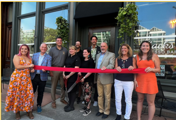
Stacks Espresso Bar, 13 Third Street in Troy VISIT stacksespresso.com