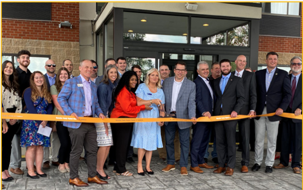
Holiday Inn Express, 8 Empire Drive in East Greenbush VISIT ihg.com