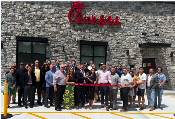
Chick-Fil-A, 502 North Greenbush Road in Rensselaer VISIT chick-fil-a.com/locations/ny/north-greenbush-ny