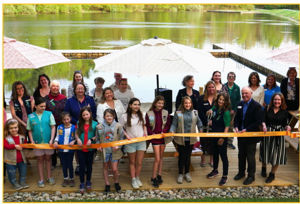
Camp Is-Sho-Da, 231 Upper Mannix Road in East Greenbush VISIT girlscoutsny.org/en/camp-properties/is-sho-da.html