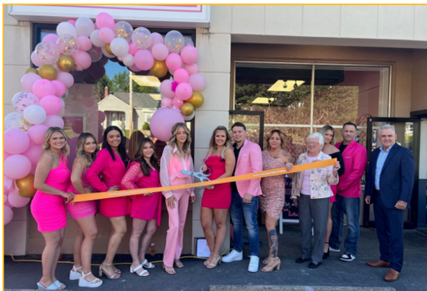
Dolled Up, 470 North Greenbush Road in Rensselaer VISIT vagaro.com/dolledup8