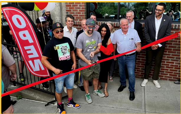
Stage One Dispensary, 810 Broadway in Rensselaer VISIT stageonedispensary.com