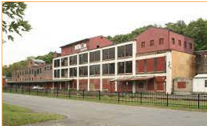
Shoddy Mills will be redeveloped into a mix of apartment and commercial space.

It's been a long road for the project, which has been owned by previous developers whose efforts helped lay the groundwork for today's progress. Four years ago, Bath Springs Development Co. LLC of Rensselaer applied to the National Park Service to have the buildings within the William Barnet &