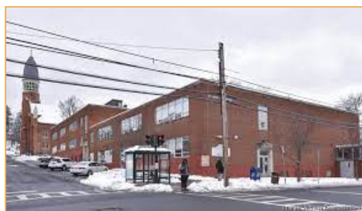
The McManus Center at 50 Herrick Street in Rensselaer.