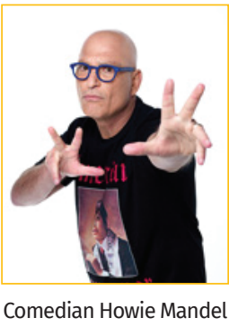
Comedian Howie Mandel