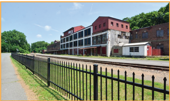
A site of potential redevelopment is the vacant Hilton Center, a former historic mill.

Also at the northern end of the city, Rensselaer is conducting a Combined Sewer Outflow Elimination Study. It’s purpose is to improve the capacity of the city’s water infrastructure on the northern waterfront by eliminating the existing combined sewer outflow. This improvement would be more efficient and cost-saving and would also better serve any future development or redevelopment of the general area, including proposals for the Hilton Center, a site that has received redevelopment interest in recent years. Funded through a NYS Environmental Facilities Corporation Engineering Planning Grant, the study’s completion date is early 2023.