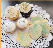
The Cakerino Bake Shop on Washington Avenue specializes in vegan and vegan/gluten free custom cakes and desserts.