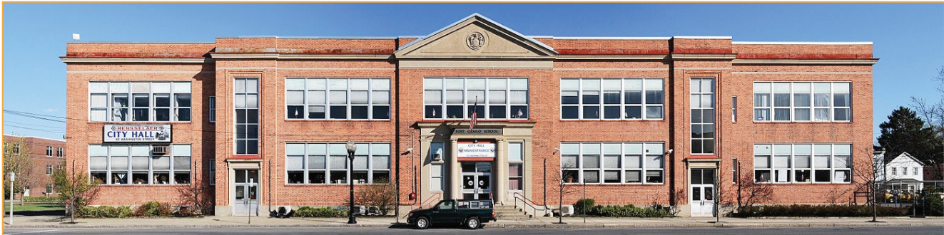
The Rensselaer Community Center includes the offices of City Hall.

A NYS Brownfield Opportunity Area (BOA) grant is enabling the city to pursue designation for project funding through the Regional Economic Development Councils. The BOA program is designed to help clean up identified brownfield sites and explore potential reuse options but it also seeks to develop/redevelop properties located near brownfields in order to “empower communities to revitalize neighborhoods affected by brownfields.” Rensselaer’s proposed BOA encompasses downtown, the train station, and DeLaet’s Landing. Phase 1 of the BOA is nearing completion and the city will resubmit for designation in time to apply for CFA funding in 2022. VISIT rensselaerplanning.com