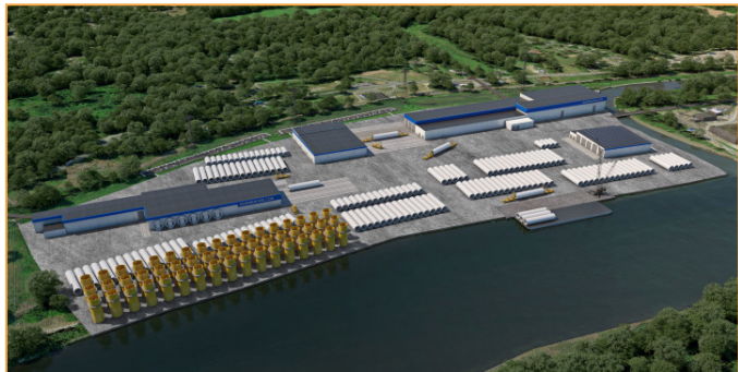
Artist's rendering - Marmen-Welcon