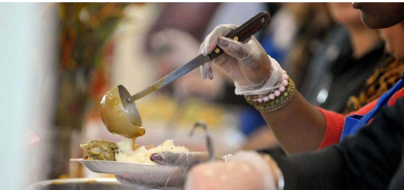
Photo: The Welcome Table at the St. John's/St. Ann's Outreach Center provides warm meals to Guests.