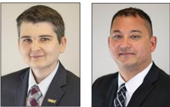
day-to-day operations in their respective offices. VISIT saratoganational.com