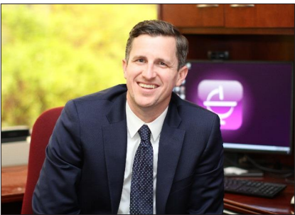
Excelsior College in 2014. VISIT excelsior.edu