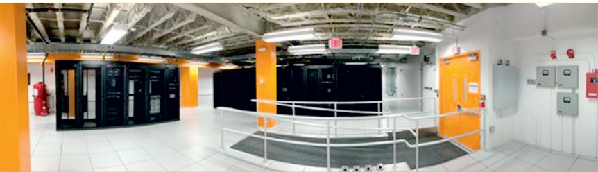
INOC DATA CENTERS 80 State Street Albany, NY 12207 | 4 Tower Place Albany, NY 12203 Ph: 518.689.4350 | inoc.net