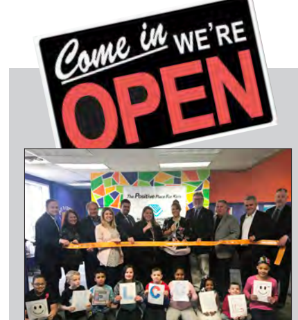
Boys & Girls Clubs of Southern Rensselaer County | City of Rensselaer bgcsorensco.org

Pioneer Bank launched Pioneer Personal Finance, a digital financial planning tool that gives customers the ability to track and get a comprehensive view of their entire financial world, including accounts associated with other financial institutions. Available to online banking customers and as a mobile app, the product logs spending, savings, debt and other data and includes features such as budgeting, cash flow management and net worth. Customers sign up at any branch or online. Visit pioneerbanking.com.