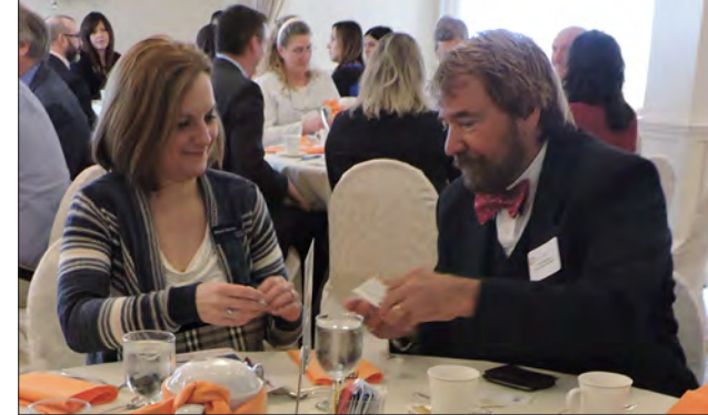
NetworkingPlus Luncheon is on Thursday, May 17 at Shaker Pointe, One Medaille Drive in Watervliet. Sign up at renscochamber.com/events. Check-in and luncheon at 11:30 a.m.; networking 12-1:15 p.m. Cost is $35 members; $50 walk-in members. Sponsored by Community Resource FCU.