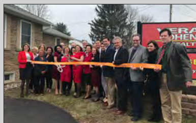
Vera Cohen Realty | East Greenbush veracohenrealty.com

Let the Chamber host your ribbon cutting or milestone event and celebrate your success! Contact Staci O’Neill at 518.687.1243 or soneill@renscochamber.com.