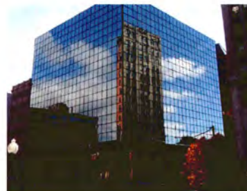
INOC | 80 State Street | Albany, NY