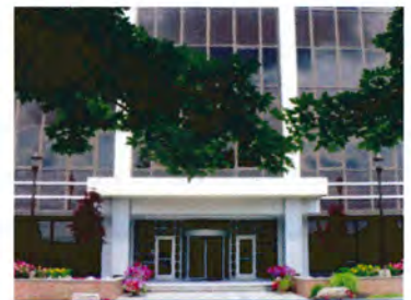
INOC | 4 Tower Place | Albany, NY