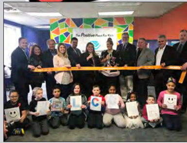
Boys & Girls Clubs of Southern Rensselaer County | City of Rensselaer bgcsorensco.org