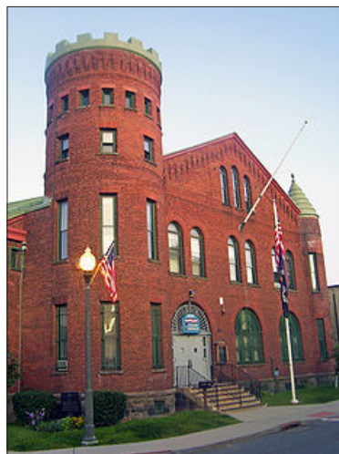
From the top: Architecturally significant buildings abound; renowned folk artist Anna Mary Robertson, “Grandma Moses,” was a resident of Hoosick Falls; solar panels at Berle Farms; Hoosick kids meet Rensselaer County’s Dairy Queen; the Estabrook Octagon House; Brown’s Brewing Co; Berle Farms’ organic yogurt; the Hoosick Falls Armory.

The public is invited to attend the next “Hoosick Rising” meeting, scheduled for Thursday, September 25, at 6:30 p.m. at The Armory, 80 Church Street in Hoosick Falls.