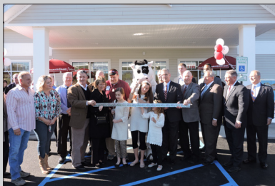
Stewart's Shops | Troy stewartsshops.com