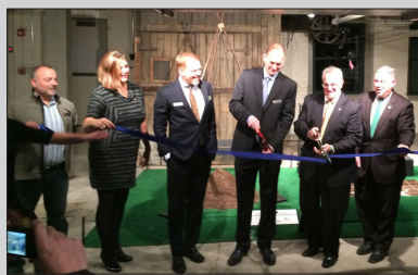
Hudson Arthaus | Troy hudsonarthaus.com

Excelsior College has launched a Bachelor of Science in Public Health degree for students pursuing careers and graduate degrees in public health. Students will learn to address health issues with diverse stakeholders and use critical thinking skills in health care delivery systems. Visit excelsior.edu .