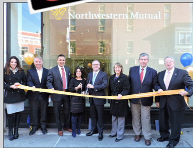
Northwestern Mutual | Troy northwesternmutual.com