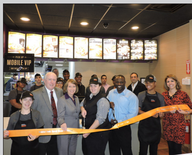
Taco Bell | Rensselaer tacobell.com