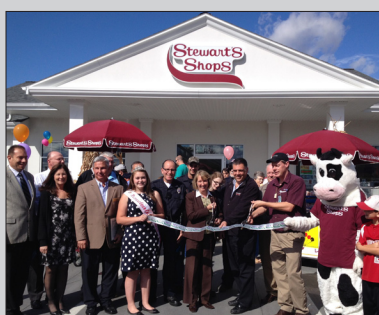
Stewart's Shops | Cropseyville stewartsshops.com