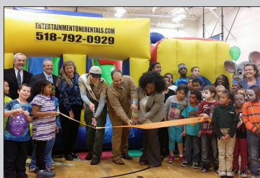
Troy Boys & Girls Club | Troy tbgc.org

Capital Roots , formerly known as Capital District Community Gardens, has unveiled its new headquarters and food hub, The Urban Grow Center, at 594 River Street in Troy. For almost 40 years, the nonprofit's programs have provided public access to locally-grown fresh food and urban green spaces. Visit capitalroots.org .