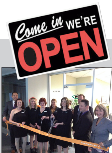
Greenbush Eye Center | East Greenbush greenbushyecenter.com