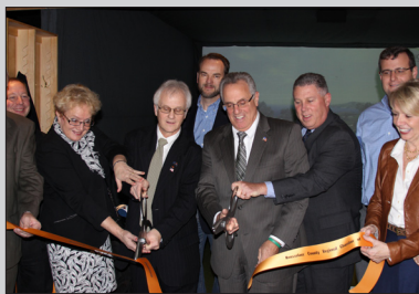
OptiGolf Troy | Troy optigolftroy.com