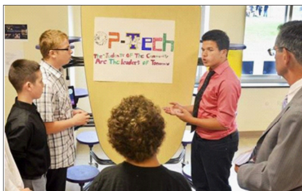
Clockwise from top right: P-TECH students use a team approach to solve real-life manufacturing challenges; students and staff discuss P-TECH's mission; Commissioner of Education and President of the University of the State of New York Dr. John B. King, Jr. visits Riverfront P-TECH classes.

focused high school that gives students the skills manufacturing employers need. The inaugural Riverfront class of 34 started in September and is one of 16 P-TECH models in New York State.